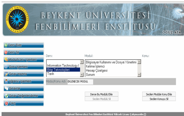
Figure 6. Addition of module or subject to selected course

To add or delete a module/subject to selected course, "Modül/Konu İşlemleri" button must be pressed. To add/delete a subject can be done as shown in Figure 6.