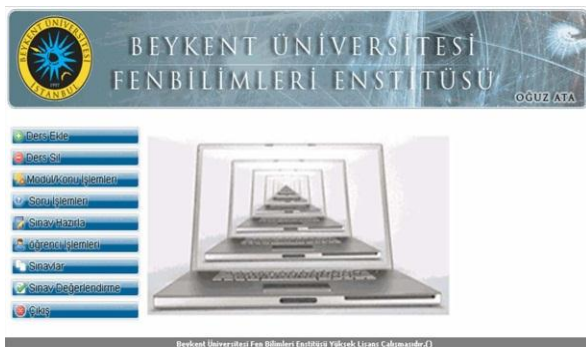
Figure 3. Administrator Screen

If your account has administrator privilege than Figure 3 is appeared.