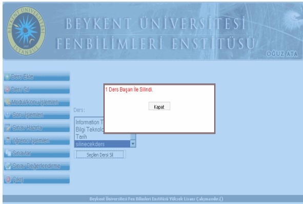
Figure 5. Course deletion screen

To delete a course "Ders Sil" button is pressed then Figure 5 is shown by the developed program.