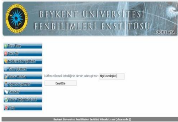
Figure 4. Course addition screen

To add course, "Ders Ekle" button is pressed then Figure 4 is shown.