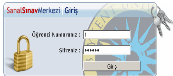
© 2007 | Beykent Üniversitesi | Ar-Ge Merkezi

To enter the system, login name which is student name and password is requires as shown in Figure 2.